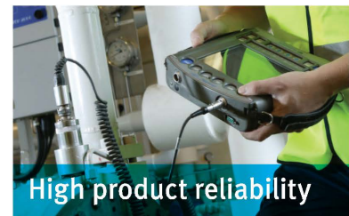
High product reliability